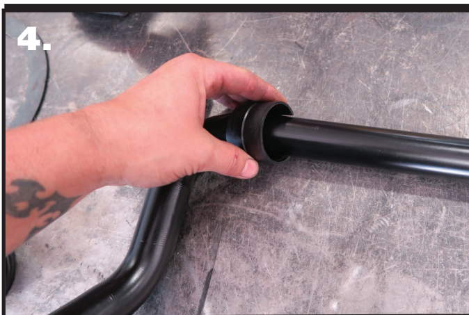
4. Open the Delrin Liner at the split and slip it over the SwayBar. Position it in the area that the bushing will ride based on the location of the stock swaybar. Do this on both ends of the swaybar.