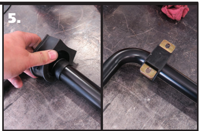
5. Open the SwayBar Bushing at the split and slide it OVER the Delrin Liner. Do this on both Delrin Liners. Next, slip the Bushing Straps over the SwayBar Bushings.