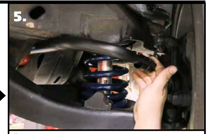
5. Insert the sway bar in the stock location. See below for installation tips.

4. Open the sway bar bushing at the split and slip it OVER the sway bar. Do this for both bushings