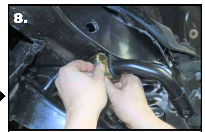
7. Install a 5/16" lock washer & 5/16" flat washer on the 5/16"x 1" hex bolts.

6. Slip the bushing straps over the sway bar bushings. Line them up with the OEM mounting holes.